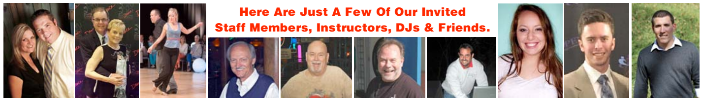
Here Are Just A Few Of Our Invited Staff Members, Instructors, DJs & Friends.

This Event Is For Juniors. But Adults Are Welcome To Participate With Their Juniors.